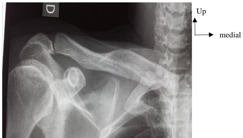
Figure 3 : vicious callus of lateral-end with shortening of right clavicle (Radiograph)