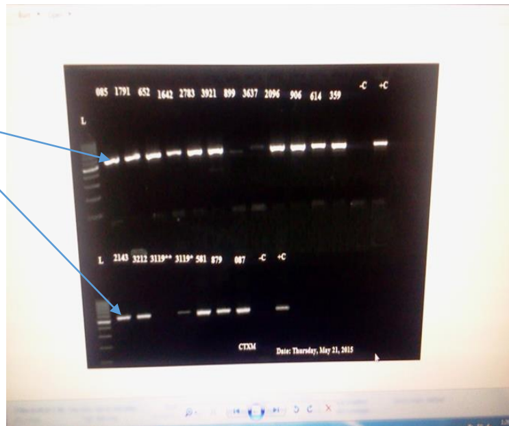
Isolates 3119**negative for bla CTX-M, +c and -c are positive and negative controls, L is ladder standard 100bp